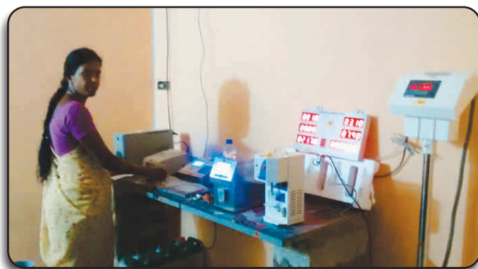
DPMCU at work in Andhra Pradesh

Efforts were made in fulfilling the critical needs of power in dairy sector and also reducing the downtime of the equipments, this resulted into single largest business acquisition for more than 1600 solar based Data Processor Milk Collection units (DPMCU) under National Dairy Plan from one of the leading Milk Producer Company in Andhra Pradesh. The total order of more than 2600 numbers DPMCU/Solar DPMCU was received from milk unions of Andhra Pradesh, Punjab and Gujarat during the quarter.