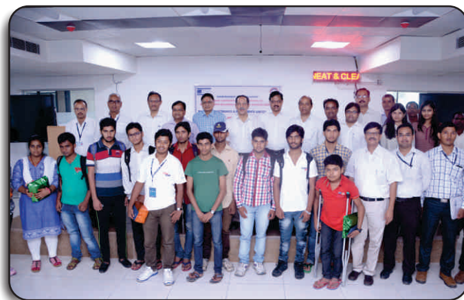
REIL team & MNIT officials with students at MNIT

Under Corporate Social Responsibility the Company has awarded scholarship to the students of MNIT, Jaipur, belonging to disabled Category. Under the initiative, cheque of Rs. 11000/- along with Books were given to 16 students selected for scholarship.