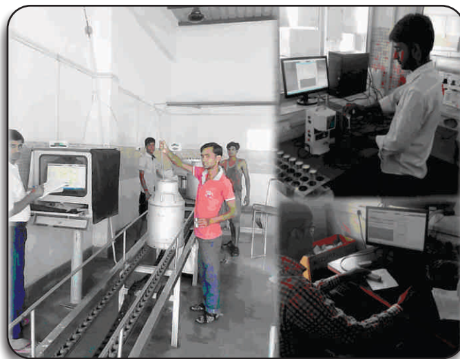
RMRD Solution at work at MCC, Paayias, Rajasthan

first order for Raw Milk Reception Dock (RMRD) solution from Maharashtra and Agartala after successful operations in Madhya Pradesh, Uttar Pradesh, Gujarat and Rajasthan.