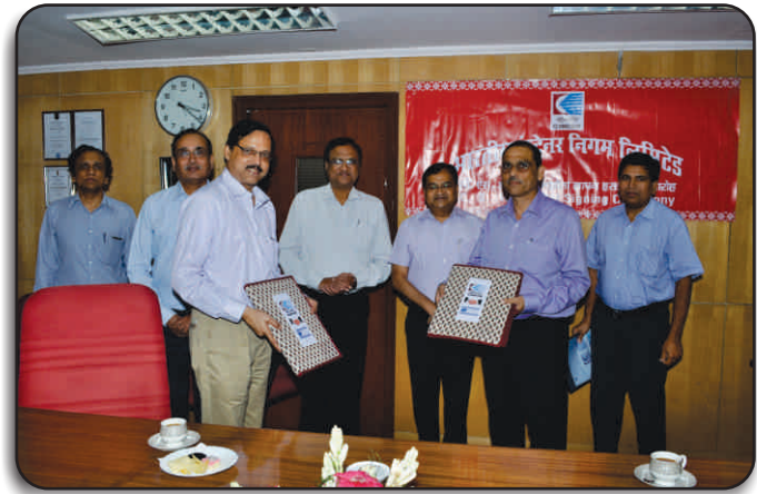
MoU signing ceremony for CSR project of CONCOR in the august presence of MD REIL and CMD, CONCOR at New Delhi

The Company has lived up to its promise of executing CSR projects for various organizations including CONCOR and POWERGRID and installed Solar Power Lighting Systems in remote villages of Uttar Pradesh to ensure safety and security in the night hours.