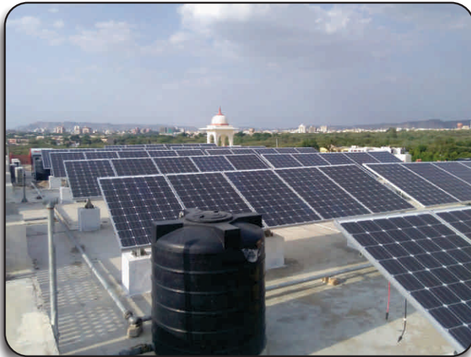
45kWp SPV Grid connected SPV Power Plant installed at RSRDC, jaipur under RREC scheme

Under RREC rooftop programme, the orders were received for supply, installation and commissioning of more than 1 MW capacity power plants in the home state, to be installed at Rajasthan Housing Board, RIICO Jaipur, Nagar Nigam Udaipur, Nagar Nigam Bharatpur, MNIT Jaipur, RRVPNL Jaipur, Poornima Handcraft Jaipur, SMS Stadium, Apex Bank, Sanwaliya Seth Trust, RSMM Ltd Udaipur, Indian Institutes of Engineers, Ajmer Development Authority and at the temple, Khole Ke Hanuman Ji Jaipur.