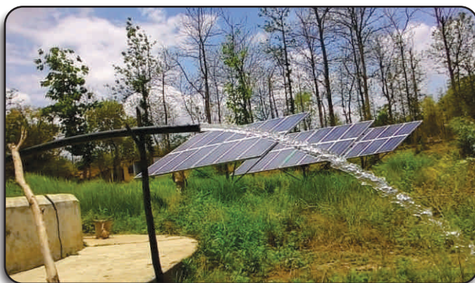
5HP Solar Water Pumping System under MPUVN

The Company continued to undertake installation of SPV Water Pumping Systems under Horticulture scheme in the state of Rajasthan and in the state of Madhya Pradesh by supplying SPV based water pumps of 3 HP and 5 HP capacities.