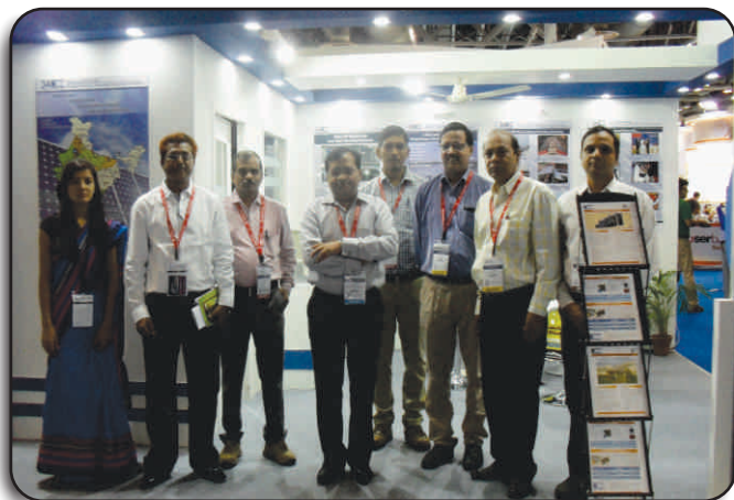
The team REIL at the expo

During the event, the Company exhibited its vast experience in the field of Renewable Energy. The prestigious project executed by REIL and their impact on livelihood was also shared with the customers and got appreciation from visitors and government officials.