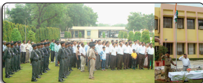
Flag Hoisting Ceremony on 15.08.2015